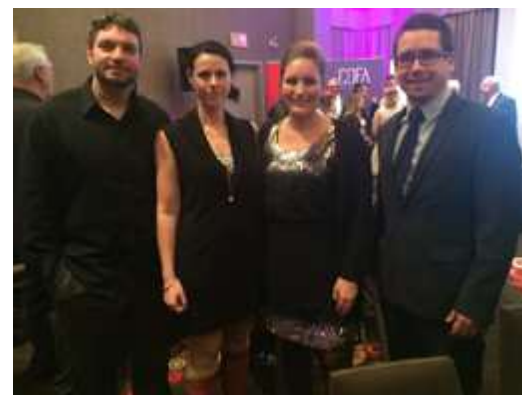
Winner of the 2015 Entrepreneurship Gala - Great Slave Lake Safaris