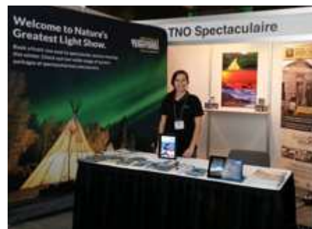
Océane Coulaudoux, International Tourism & Travel Show, Montreal

Jacques FANGEAT (France) (Free translation)