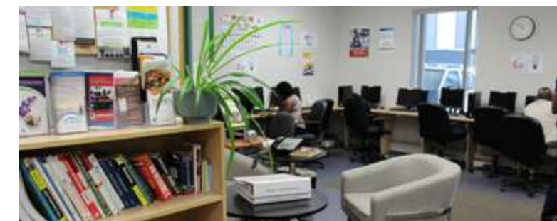
The NWT Career Centre